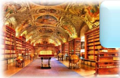
ITSF 2006 – Prague Corinthia Towers